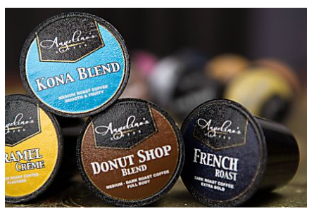
If You're a Keurig Addict, Read This: 4 Ways to Save on K-Cups Coffee Magazine

Do This Every Time You Turn On Your Computer... Web Life Advice