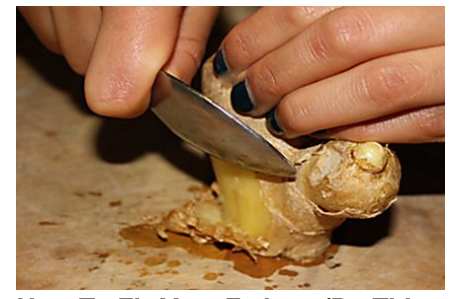
How To Fix Your Fatigue (Do This Every Day) EnergyAtAnyAge.com