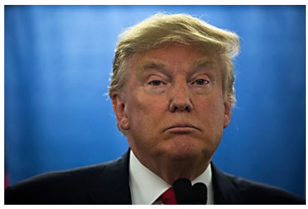
Palestinian media attacks pro-Palestinian activists as Trump era looms