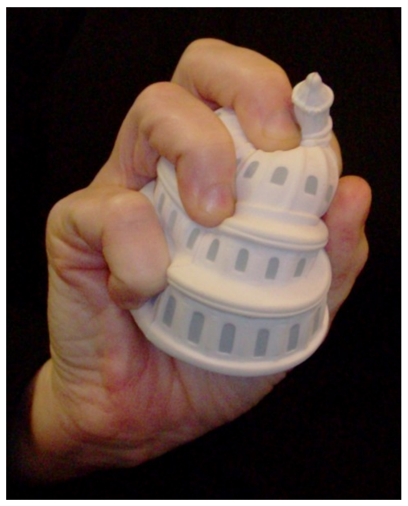
How to feel some sense of satisfaction from the Capitol: this week's second prize, a squeezy stress-dome.