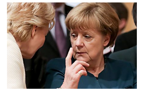
Lawmaker Quits Merkel's Party over Refugee Policy Handelsblatt Global Edition